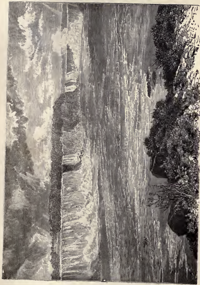
NIAGARA FALLS FROM THE CANADIAN SIDE.